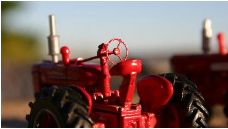
Steering Wheel Assortment

During 2010, TractorFab introduced a series of parts for detailing vehicle cabs: