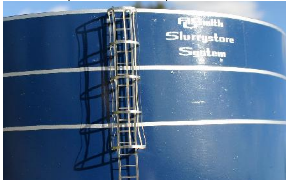
Ladder and Cage Kit

Detailing grain bins and farm scenes is a lot easier with these TractorFab details. Made from stainless steel so you don't have to paint!