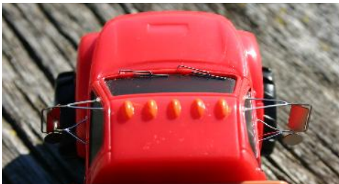
Mirrors & Windshield wiper Assortment