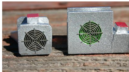
Grain Bin Fans & Screens