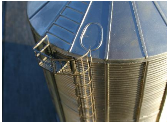
Cage Only Kit for Standi Bins Grain Bin Platforms