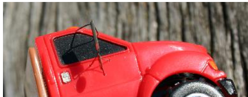
Door Latch assortment